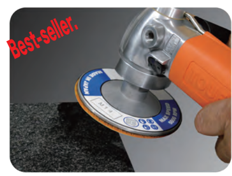
Size : 100mm(4")