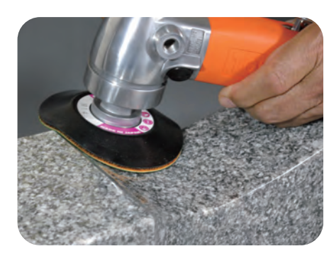
Spindle : 5/8-11, 14mm, 16mm