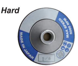
This hard pad is ideal for polishing flat surfaces and chamfer-crossing with our ultra-light design. Therefore, it perfectly reduces the burden on both polishers and on the users.