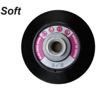
This soft pad has increased flexibility to polish curved surfaces such as bull-nose edges easily with spectacular effectiveness.